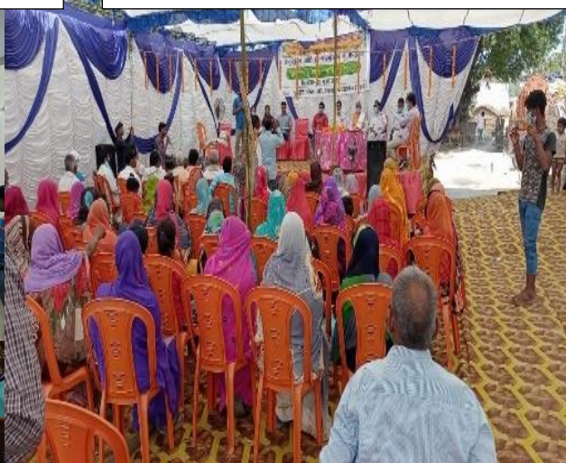
Mukhyamantri Ganna Vikas Karyakram at Sugar Mill