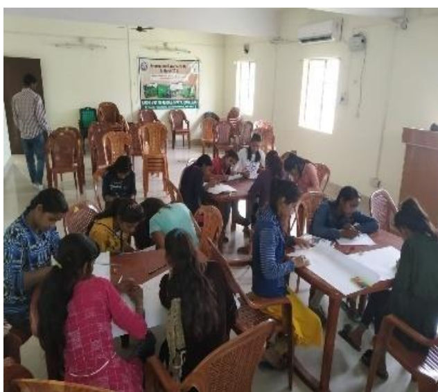
Painting competition on International Women day