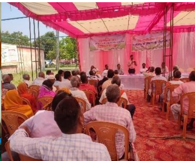
Farmer Scientist Intraction