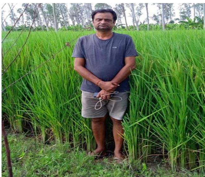
ZT DSR (CRA)