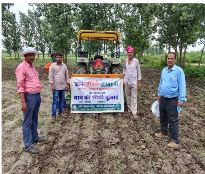
ZT DSR (CRA)