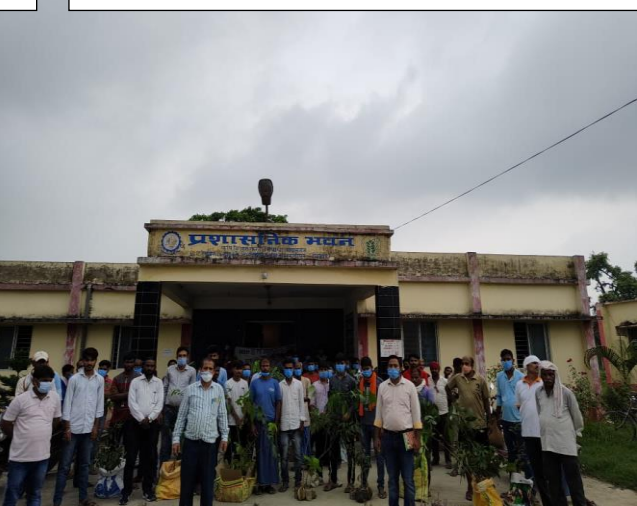
Planting Material (JSA)