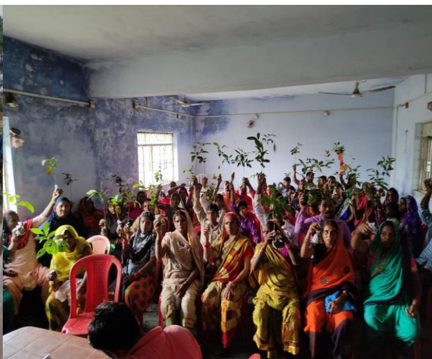
Saplings distributed on Poshan Vatika and Tree Plantation Programme