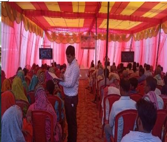
Scientist Farmer Interface and Live telecast