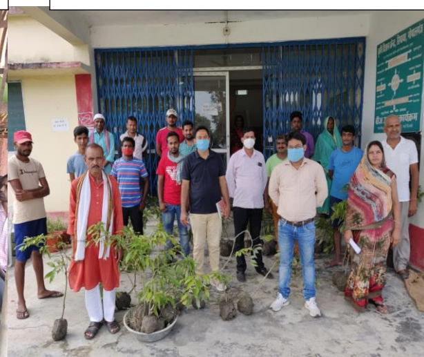
Plantation materials to farmers under JSA