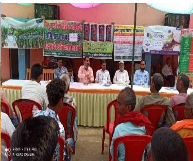
Seminar on sugarcane cultivation (sugar mill)