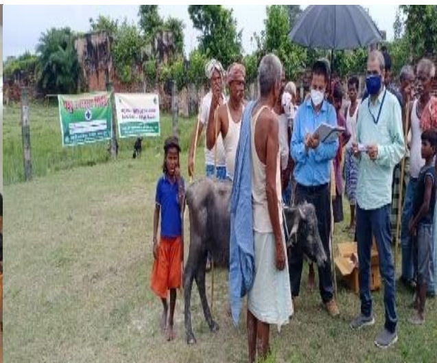
Animal Health Camp