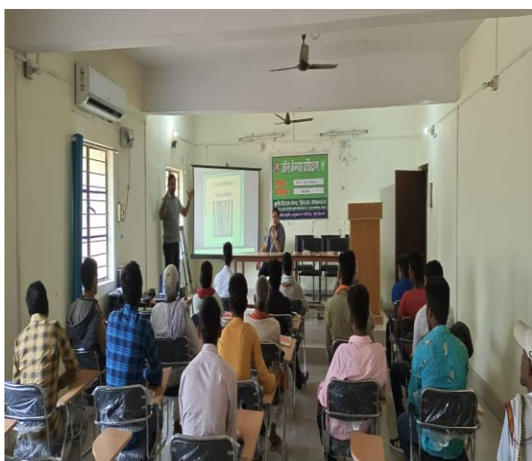
PF training on “Bamboo Processing”