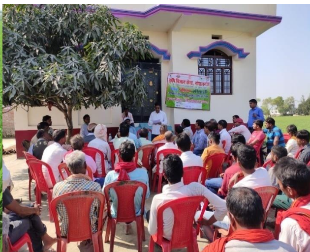
PF training (CRA)