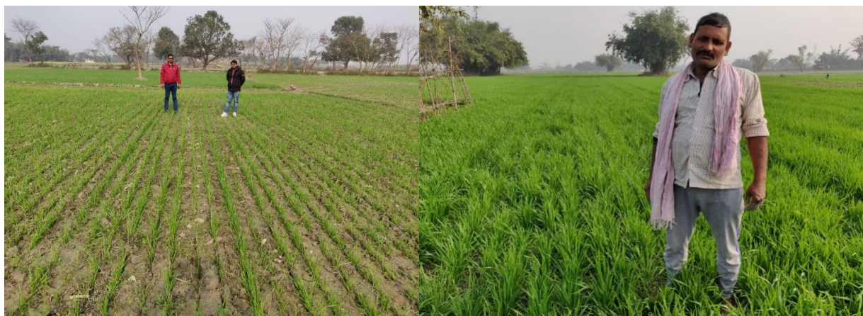
Zero till wheat sown field

3.9. a. Give details of indigenous technology practiced by the farmers in the KVK operational area which can be considered for technology development (in detail with suitable photographs)