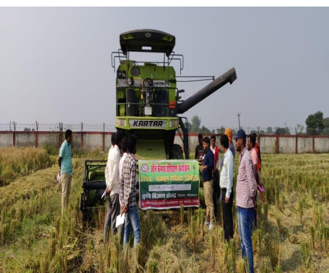
Training on Combine harvester for drivers