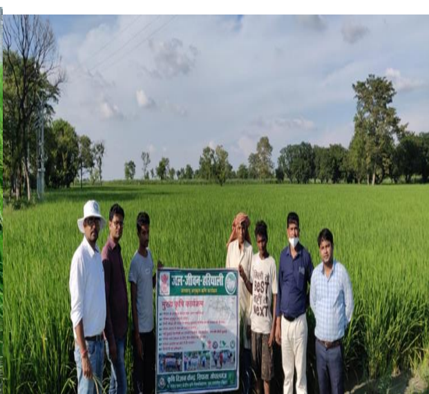
Field visit ZT DSR (CRA)