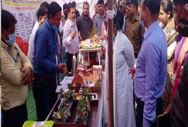
Exposure visit to BISA under CRA