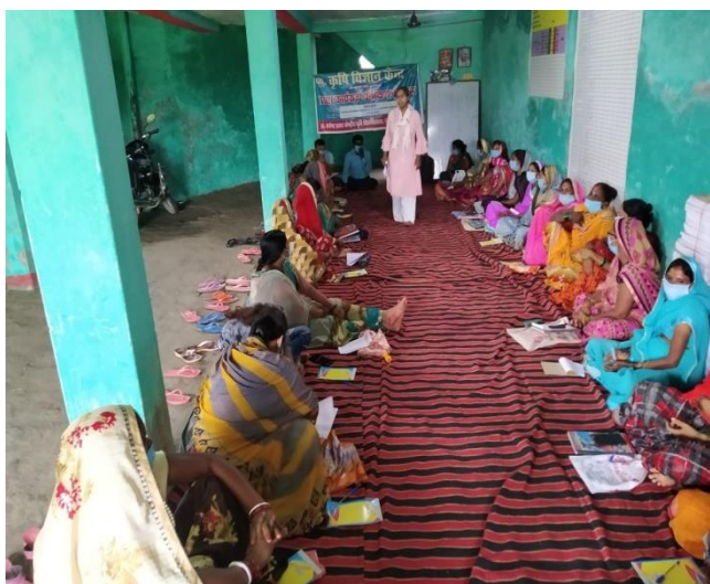
Training on sanitation and Hygiene