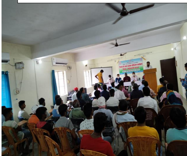
Training on Bee Keeping at KVK (ATMA)