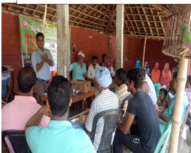
PF Training on Cultivation of oilseed