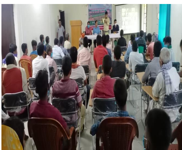
Live telecast of Food and Nutrition programme