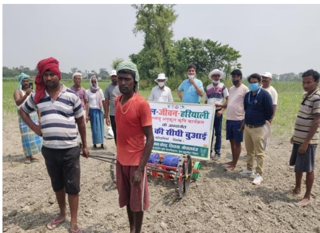
Paddy wheat seeder DSR (CRA)