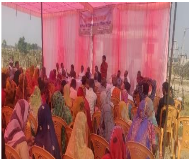
Rabi Mahaabhiyan Programme