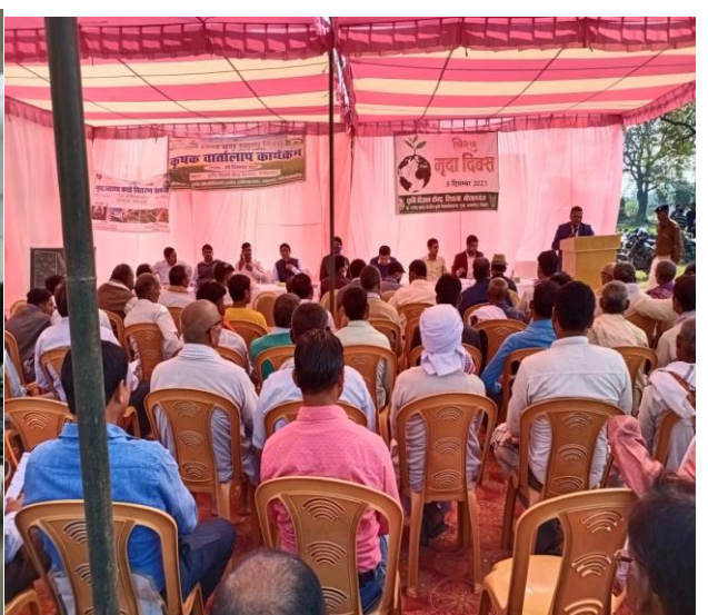
World Soil Day