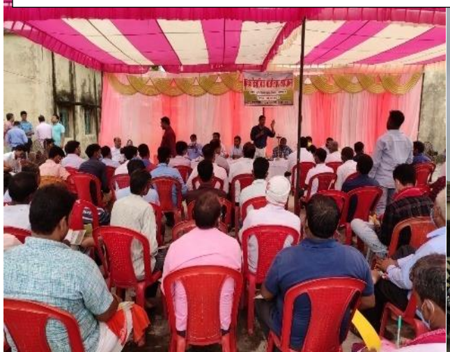
Farmer scientist Interaction (ATMA)