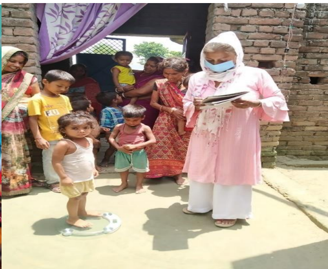
Data recording on feeding “Bal Shakti” feeding