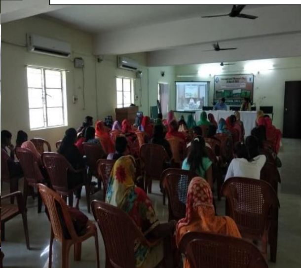
International Women day