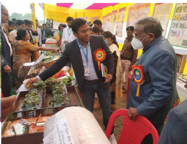
Exposure visit to DrRPCAU, Pusa Kisan