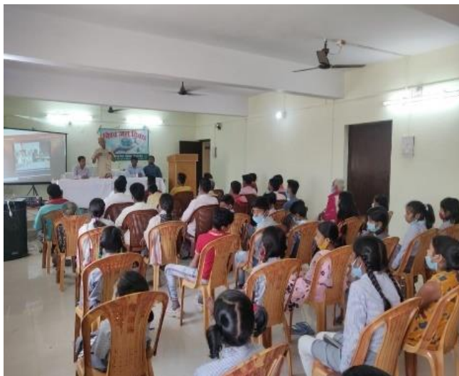
World Water Day