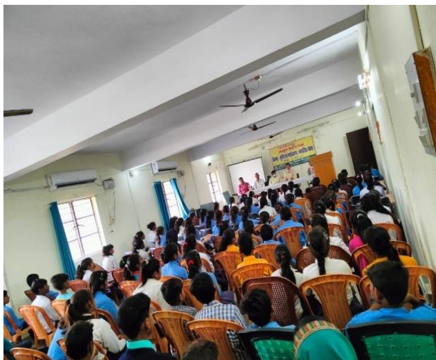
Programme on Environment: Citizen face