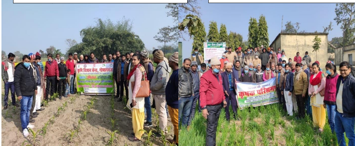
Exposure visit to CRA village