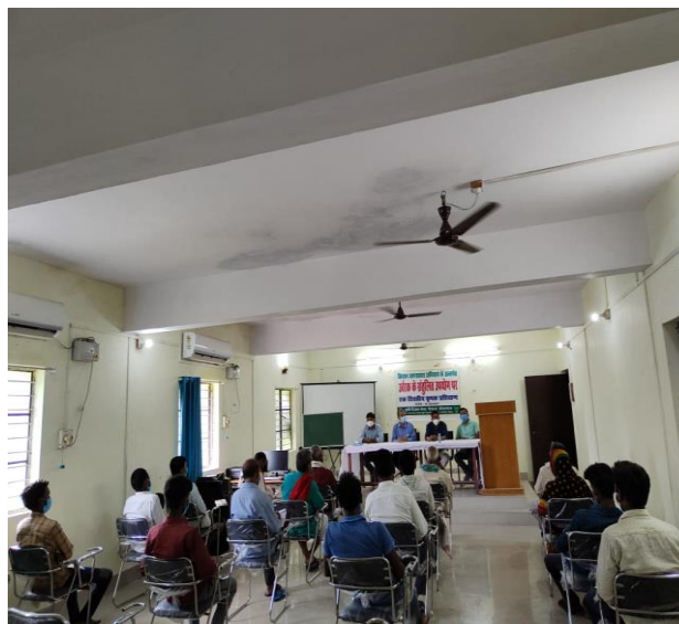
Balance Use of fertilizer