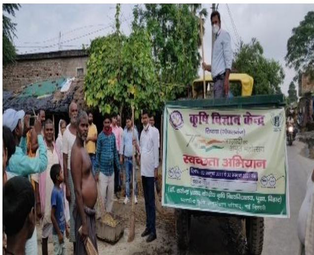
Swachhata Campaign at Khem Matihiniya