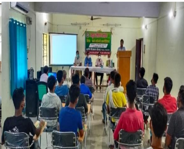
PF training on “ Farm mechanization”