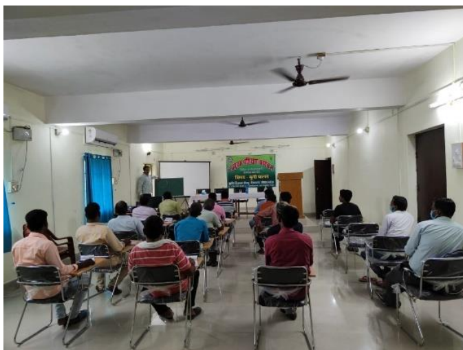
PF training on “Poultry Production”