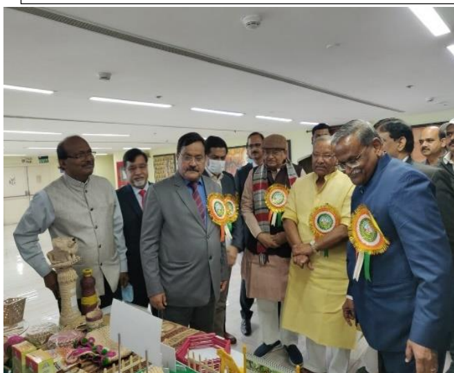
Exhibition of DrRPCAU stall at ISAE convention