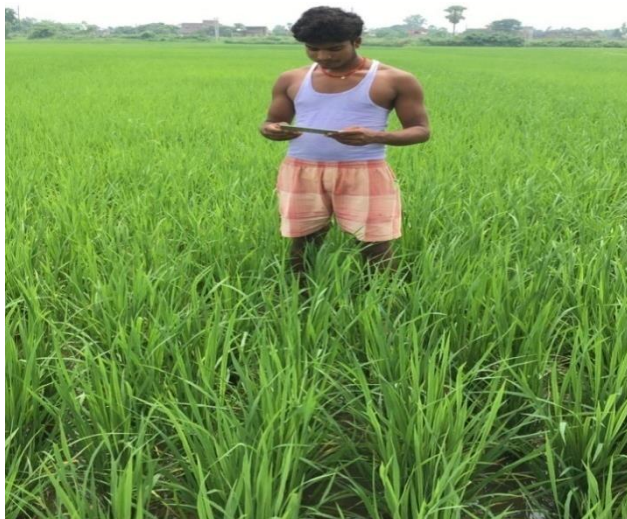
Use of LCC (CRA)