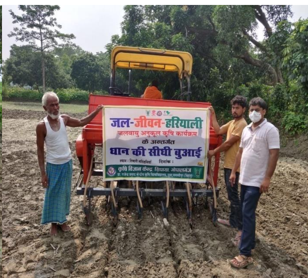
Line sowing DSR (CRA)