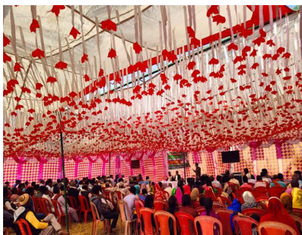
Live telecast Zero budget farming