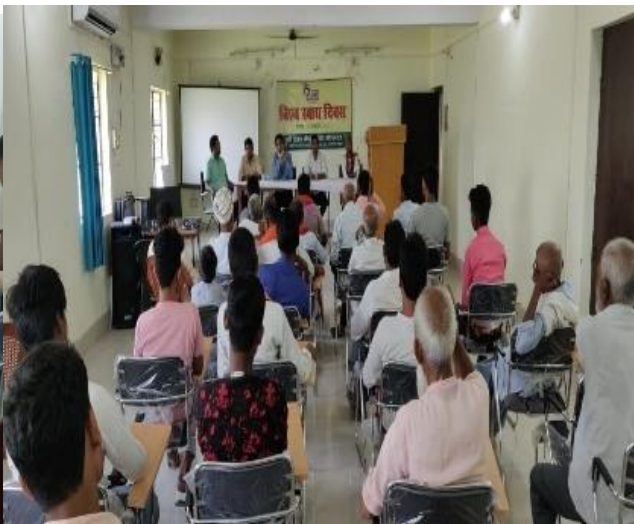
World Food Day Programme