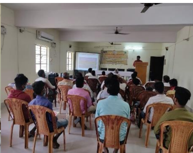
PCRA training cum workshop